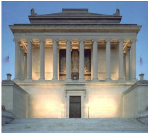
The Scottish Rite Temple, Washington DC

inscribed in mosaic stone the following words, from their own website, more Saturn and Sun worship of the false Logos of course, for freemasonry is Judaism for the Gentiles :