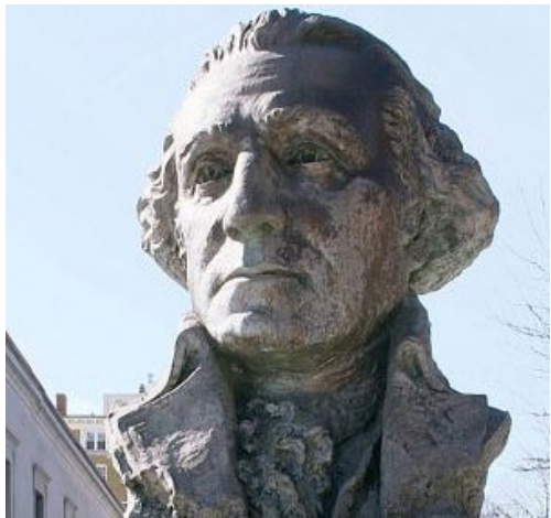
Bust of George Washington is located in the North garden of the Supreme Council Building.

There are four books on the Alter; the Holy Bible, The Jewish Torah, the Koran, and the Bhagavad Gita.