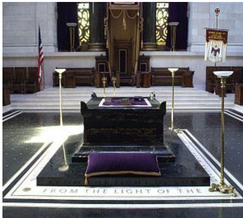
The horned altar?

“At the center of the temple stands an altar of black marble.