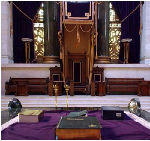
Center alter view of the House of the Temple.

There are four books on the Alter; the Holy Bible, The Jewish Torah, the Koran, and the Bhagavad Gita.